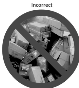
Not Properly Stacked Not shrink-Wrapped Bulbs Exposed